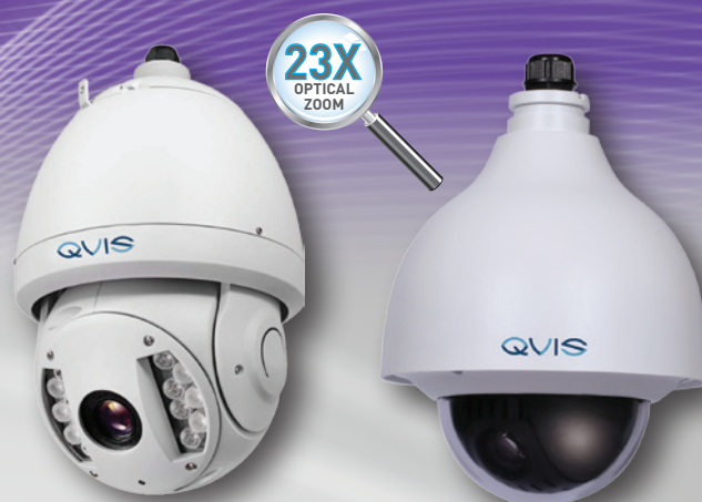
PTZ - APOIR-PTZ23